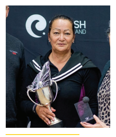
PLAYER OF THE YEAR