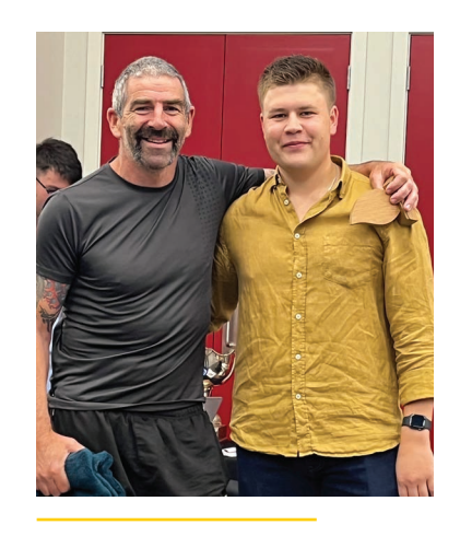
DEVELOPMENT COACH OF THE YEAR