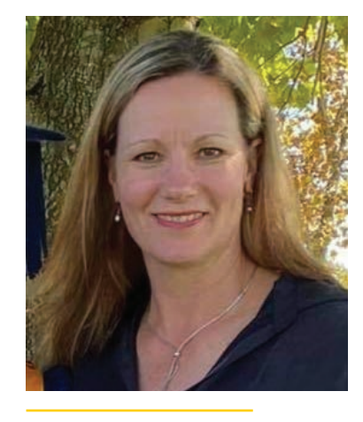
FOUNDATION COACH OF THE YEAR