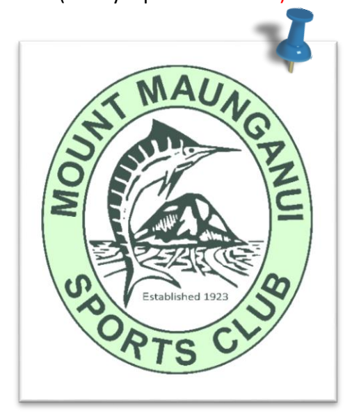
CLUB OF THE YEAR Mount Maunganui